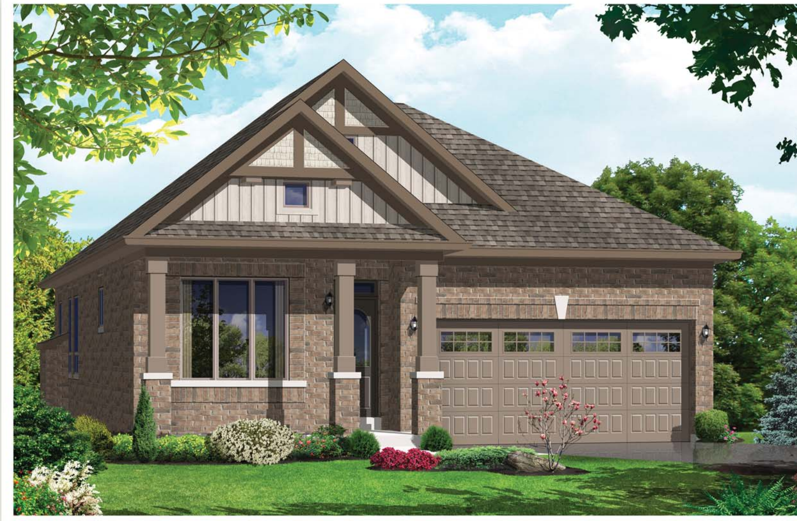
Elevation - A - 1537 sq.ft.