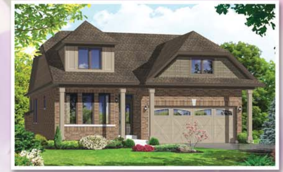
ELEV - B - 1537 sq.ft.