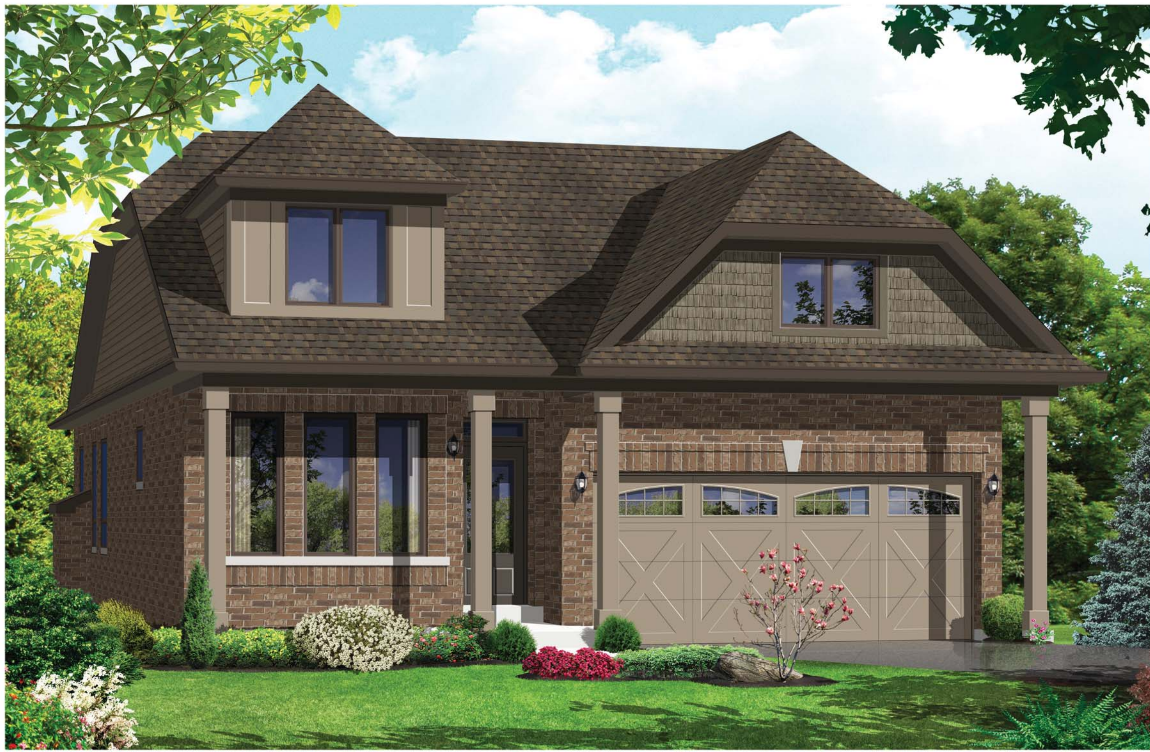
Elevation - B - 1537 sq.ft.